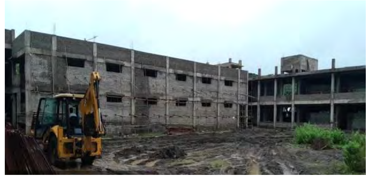
School Building EMRS-Dharani