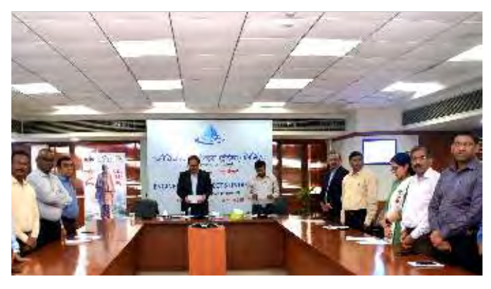
Rashtriya Ekta Diwas