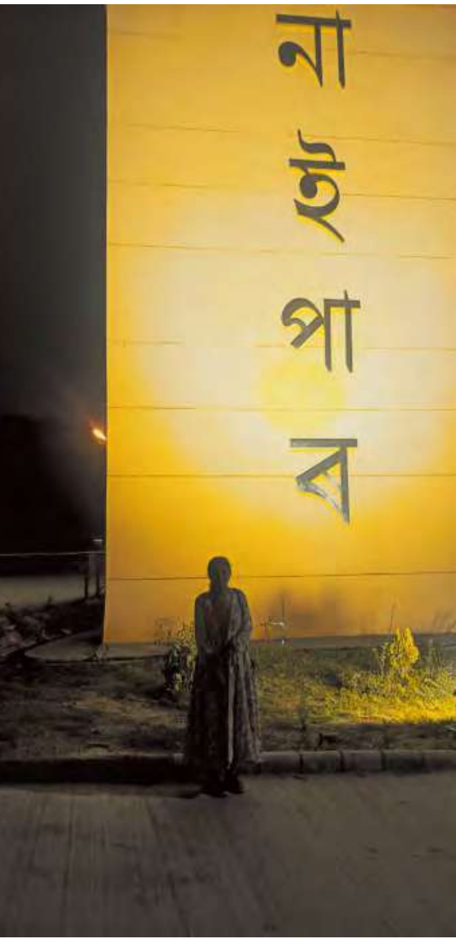
Independent Director Visit to NIPER Project