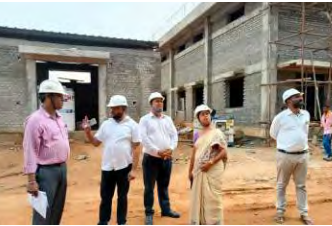
Independent Director Visit to Vizag Project