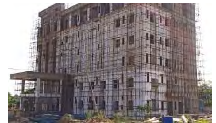
ROURKELA SMART CITY PROJECT ODISHA- COMMAND CONTROL CENTER