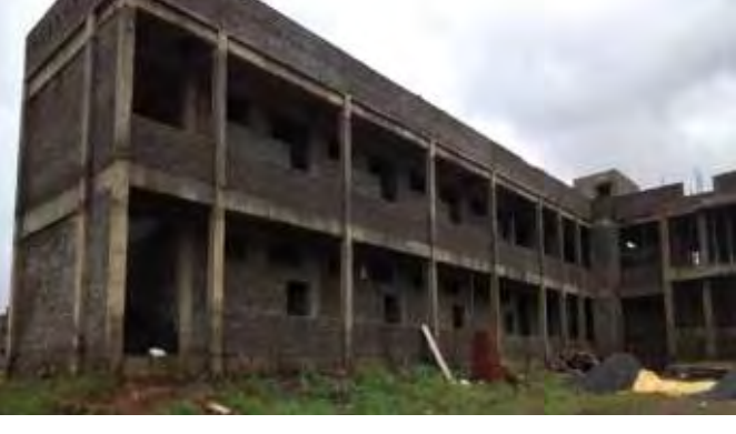
School Building C Wing, EMRS-Dahanu