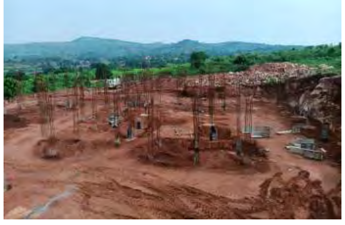
Independent Director Visit to EMRS Project