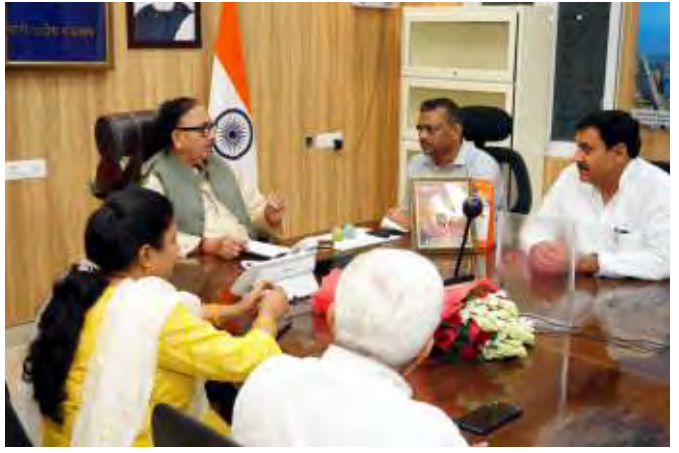
Independent Director Meeting with Hon'ble Minister