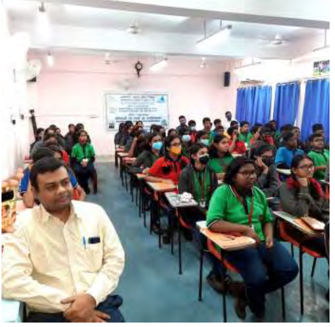
Talk show on Women and Child Empowerment