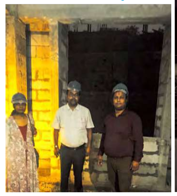
Independent Director Visit to NIPER Project