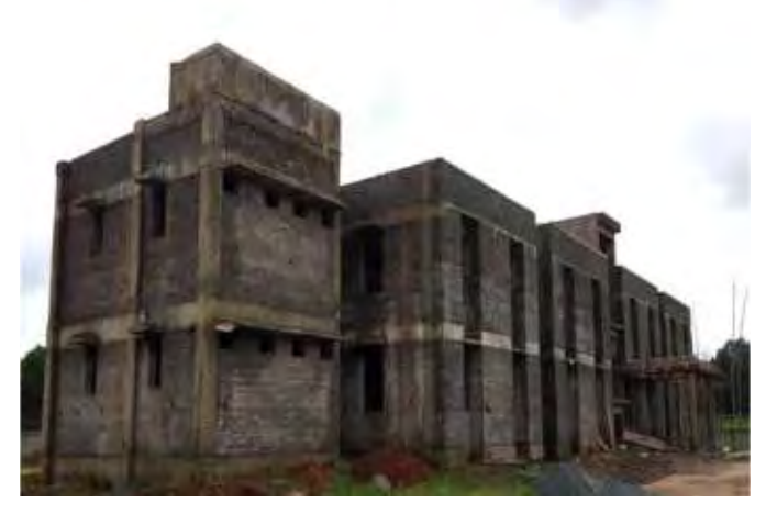
Boys Hostel, EMRS-Dahanu