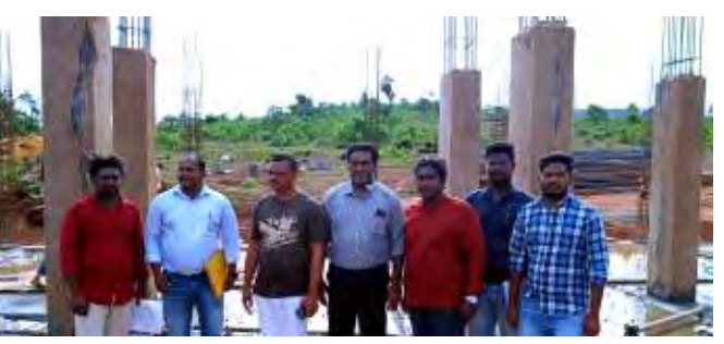
Independent Director Visit to EMRS Project